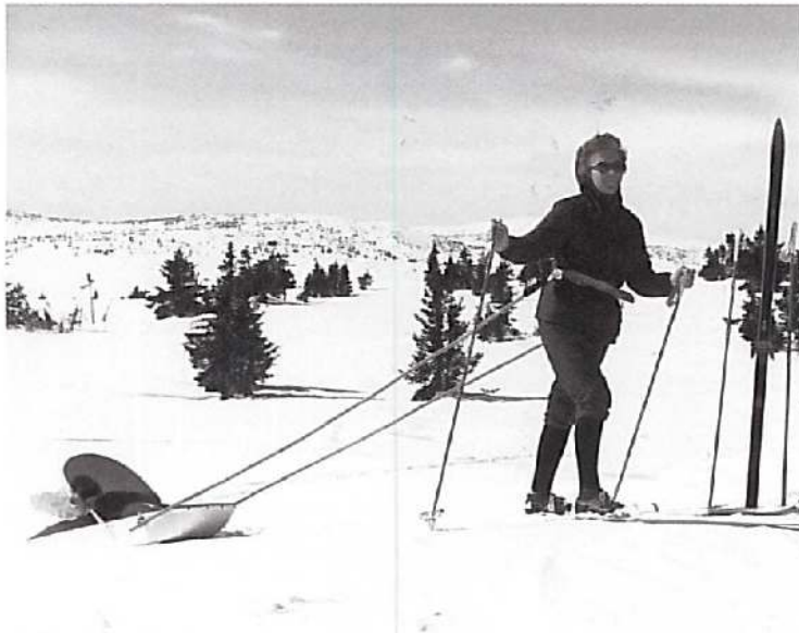
Mamsen sharing the joys of exploration with the next generation.